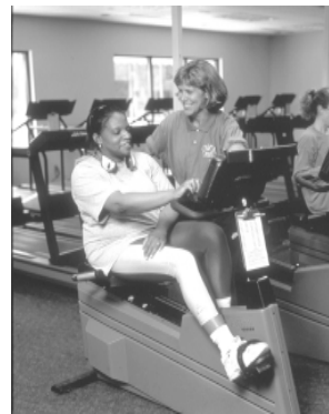
Fitness trainer teaches a member how to use new recumbent bicycles.

(This is the first of a series of articles on Fitness. See the next issue of the YMCA Newsletter for Taking on the Next Level of Challenge. )